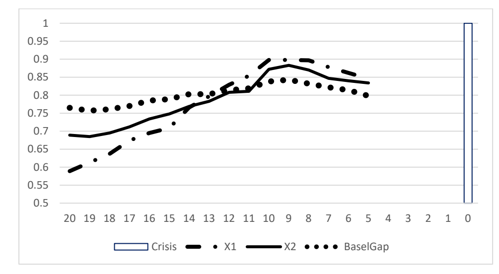
Chart 2. Predictive power of the different indicators at different forecasting horizons

The AUROC values for both functional forms and the Basel gap are calculated separately for each forecasting horizon between 20 and five quarters. The results are plotted in Chart 2.