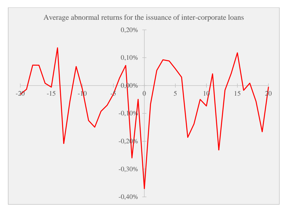
Appendix 7 Average abnormal returns for issuance and receipt of inter-corporate loans in event window [–20, 20]