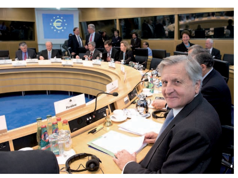
A meeting of the Governing Council of the ECB, in Frankfurt.