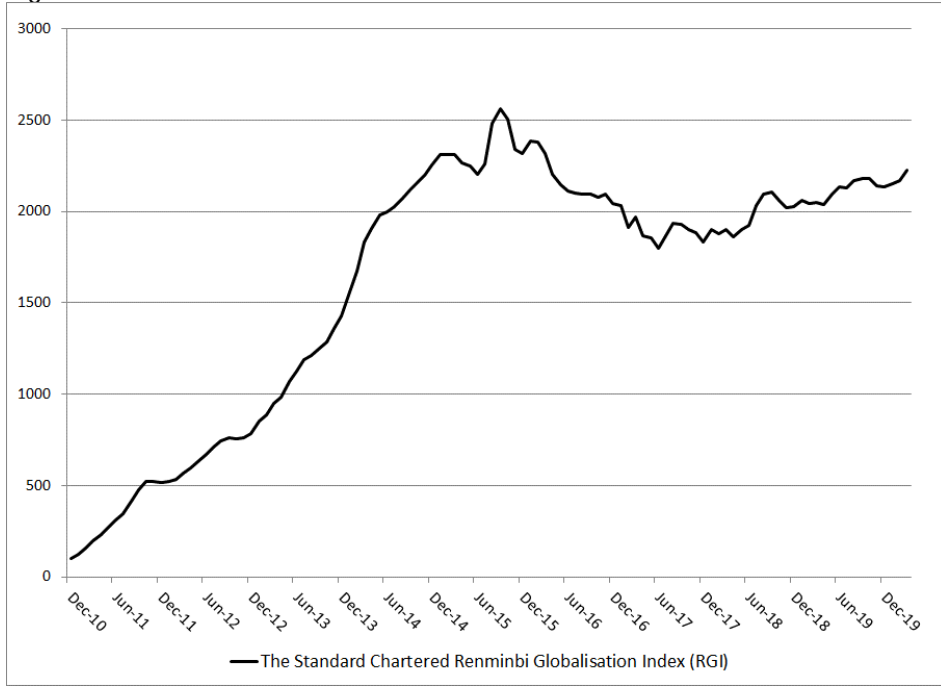
Figure 2. The Standard Chartered Renminbi Globalisation Index.